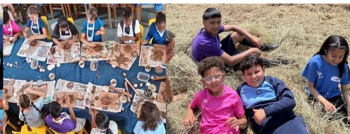
Relaxing in the field