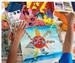
Colourful sun collages