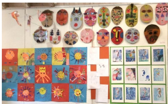
Exhibition of work for AGM