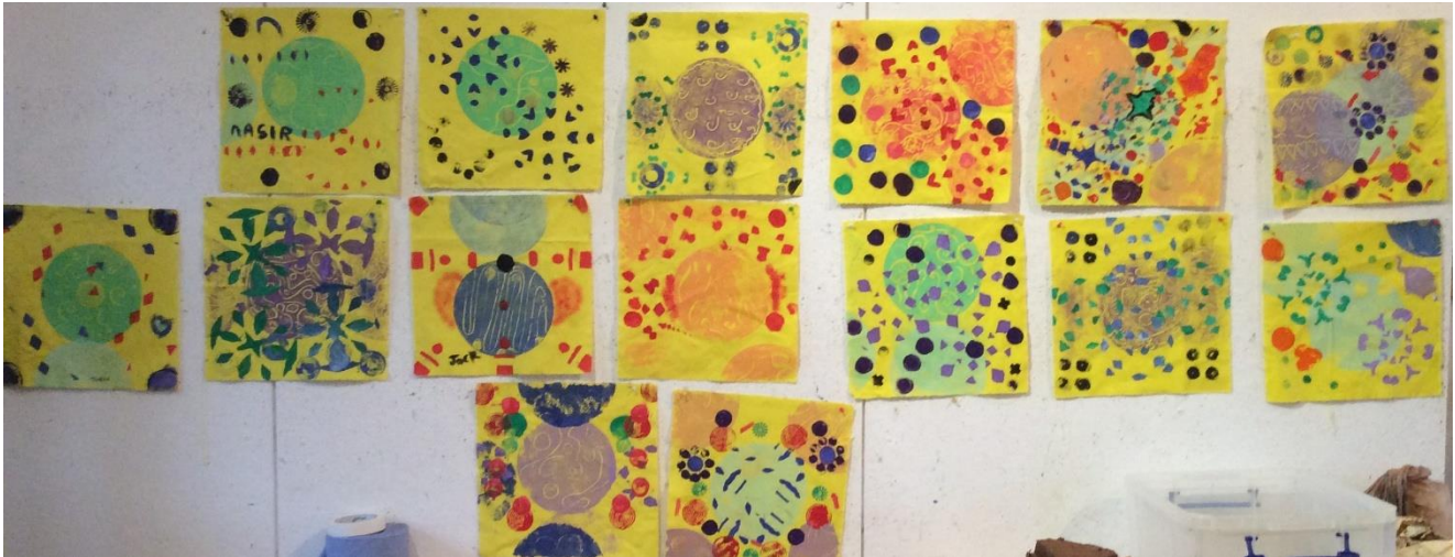
Printed patterns inspired by Yayoi Kusama