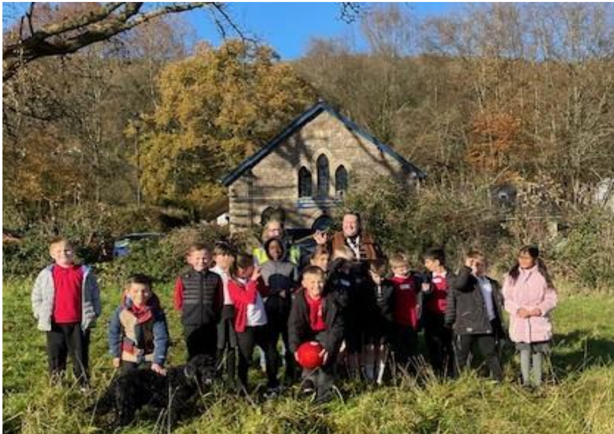
AUTUMN TERM YEAR 4 KIDS FROM RINGLAND SCHOOL NEWPORT TAKING LUNCH TIME BREAK IN THE FIELD

Happy Kidzart Creative Day in the rare Autumn Sunshine